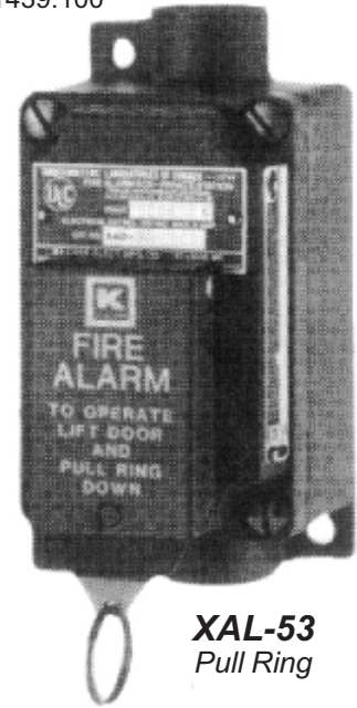
XAL-53 Pull Ring